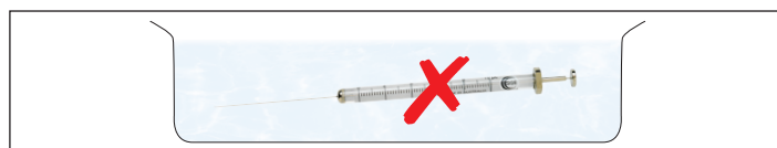
Figure 2. Do not immerse syringe in solvent