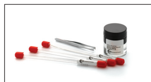
Figure 3. Needle Cleaning Kit